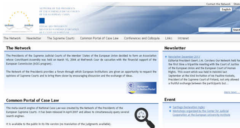
Main page of the website

every second year, or at intervals to be established by the General Assembly, (?) [to] organise a colloquium to consider matters falling within its terms of reference?.