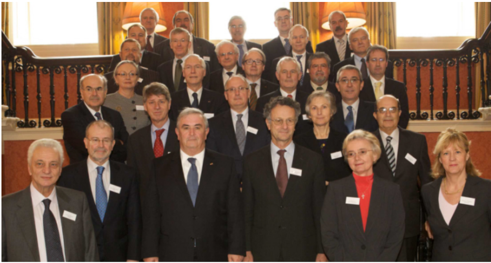
The Presidents of the Supreme Judicial Courts of the European Union (Dublin, March 2010)